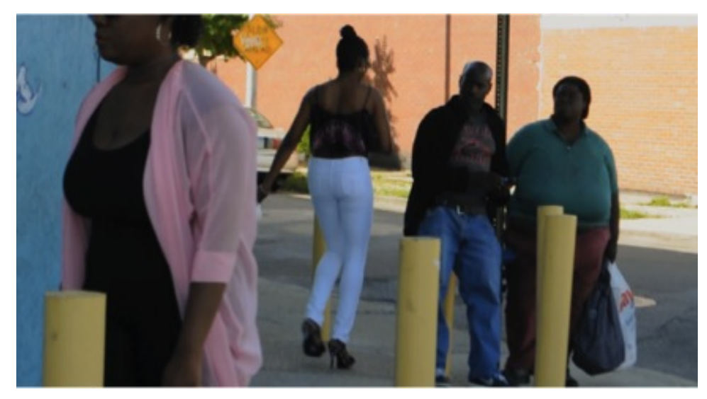
Liquor Store Theatre, McDougall Hunt, Detroit. June 2014.