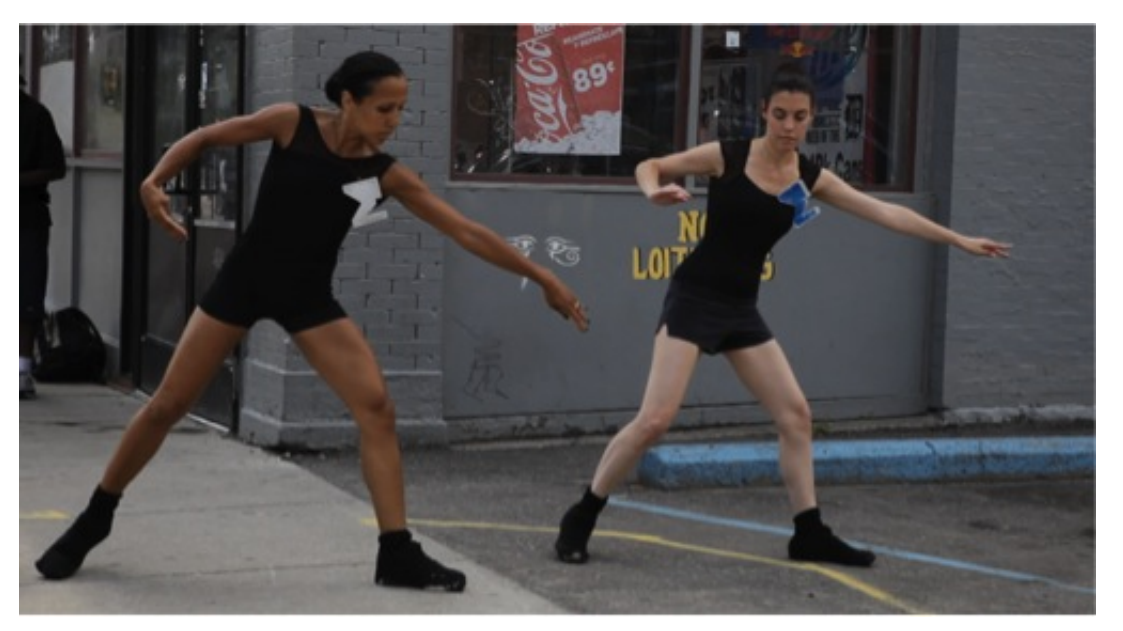
Liquor Store Theatre, Midtown, Detroit. August, 2015.

In Photo 1, LST explores the rapidly gentrifying Midtown zone, a neighborhood situated between the main north/south artery Woodward Avenue and the host of Wayne State University's campus. The liquor store in Photo 1 is on a block, however, that is not totally "gentrified". Residents from nearby low-income and senior housing still heavily populate this zone and many frequent this store. The residents pause and observe while we dance. The dancing invites residents to reverse the ethnographic gaze. The anthropologist is the spectacle; the anthropologist is the other who is observed. I feel vulnerable in these moments of being watched. I remind myself that this might be how our research participants feel when we question them, photograph them, watch them.