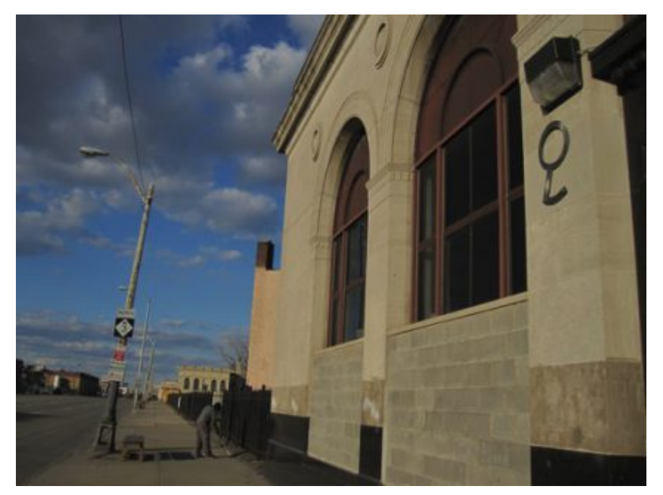
The author's studio/apartment in McDougall Hunt, Detroit, is a former Comerica bank.

Overgrown nature and ruddy country foliage collide with the gritty post-industrial coldness of concrete, metal, and asphalt. Concrete and asphalt bust up and explode from years of Detroit's brutal frost-and-thaw cycles, and the city hasn't the funds to patch many holes. Cruddy and crumpled litter twists in soft breezes, derelict signage surrounding liquor stores promise chicken gizzards, lotto, cold beer, and hot sandwiches. As I bike through the neighborhood, going East on Mack Avenue, I feel the echoes of the deep south cradling me—indigo, rust, and oatmeal colored chickens roam backyards; richly green vegetables climb sky-high from raised beds amidst Detroit steel shined and polished; everyone you pass offers "how you doin" as requisite display of sidewalk gentility.