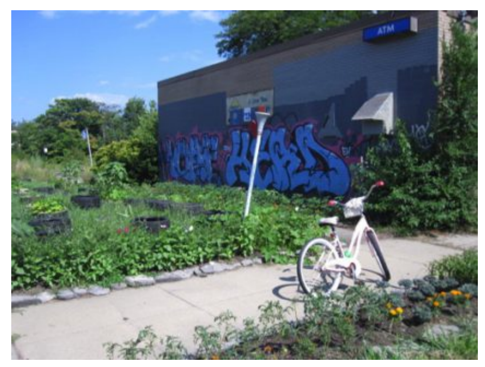
The author's garden.

Living in McDougall Hunt feels like living a work of abstract art: it's undefined. Some days it's beautiful; some days it's dizzying. Sometimes I feel like I'm screaming in a silent film. A post-industrial, cartoonish post-post modern caricature of Alice In Wonderland , the landscape of my neighborhood is dotted at turns with dreamy pheasants, menacing guard-dogs, the weathered ready-mades of artist Tyree Guyton's Heidelberg Project, the lithe butterflies glinting through my garden in the summer and the raw, white icicles clinging to angular mature tree branches in the winter. LST is in dialogue with <u>the Heidelberg Project</u>, in a cerebral, simmering, quiet, unofficial way. Guyton started his project in the 1980s during the crush of Detroit's crack and heroin explosion as a form of creative resistance. I started LST in Detroit 2014 to explore the pulsating blackness of the city. That is, the grit, the cool, the innovation, and the power that blackness has steeped here for decades.