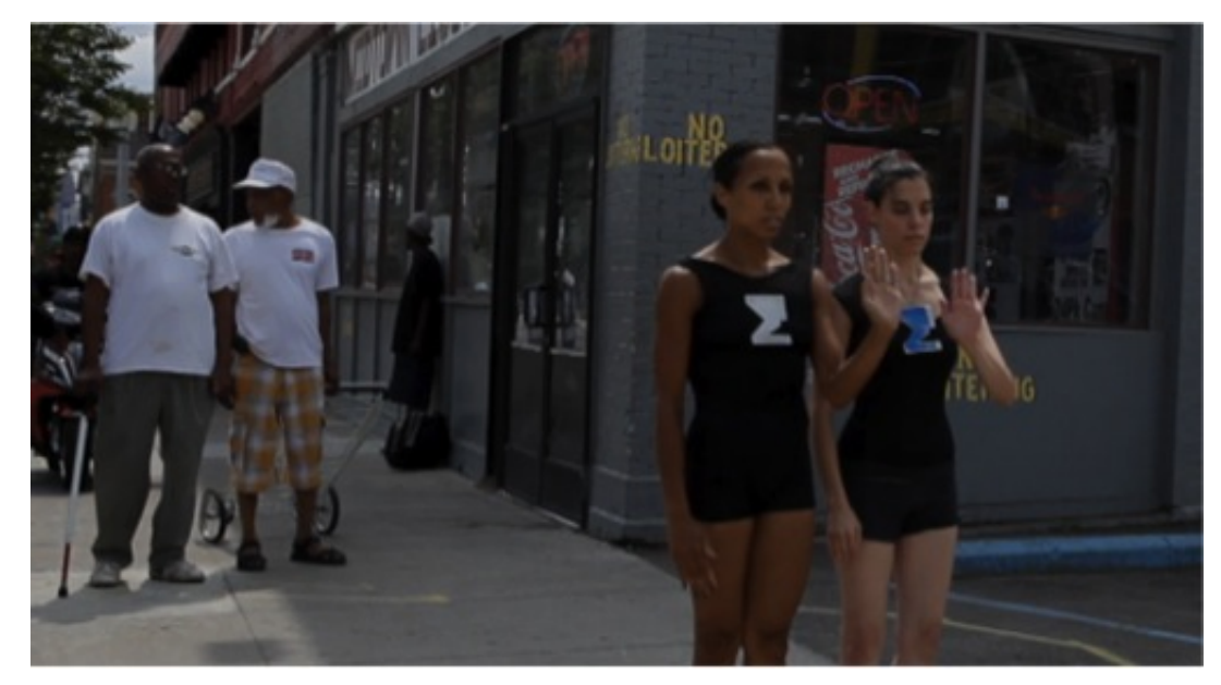
Liquor Store Theatre, Midtown, Detroit. August, 2015.

How might an anthropologist use dance to study cities? How about dance ethnography as method? The Liquor Store Theatre project (LST) is a series of choreographed dance performances and ethnographic conversations on the sidewalks and spaces in and around liquor stores on Detroit's east side. LST started in a moment where you feel tears begin to form: a solitarily emotional place of anguish, release, and sometimes joy. A moment of holding on and of letting go, where something indescribable but so incredibly recognizable is speeding to the surface, rushing at you full throttle, and all you can do is let go and let it happen, whatever it may be. It lands on the shale- and dust- coated sidewalks of the city, dancing to bizarre rhythms as it seeks to connect with people. LST sets forth choreography/ethnography as research method. It uses staged dance performances in the spaces of my neighborhood as the point where ethnographic conversations begin. In this way, creativity and improvisation are at the center of ethnographic encounters. Working in an east side neighborhood in Detroit, LST investigates the complexities of blackness in a small, unique zone of an American city in transition.